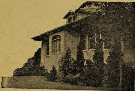
AN EVERGREEN PLANTING